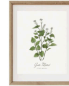
Botanical print by Hackney & Co, from £28/two, Etsy