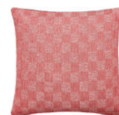
Parker weave floor cushion, £25, Dunelm